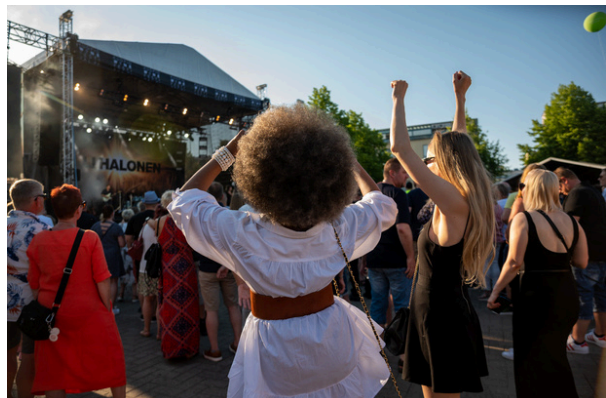
Kuopio Wine Festival