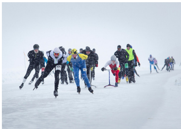
Ice Marathon