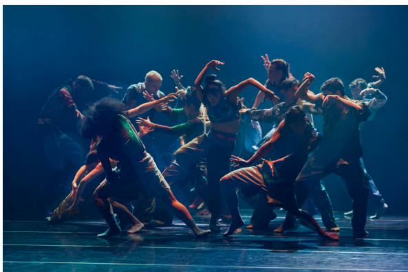
GöteborgsOperans Danskompani Wild poetry by Hofesh Shecter