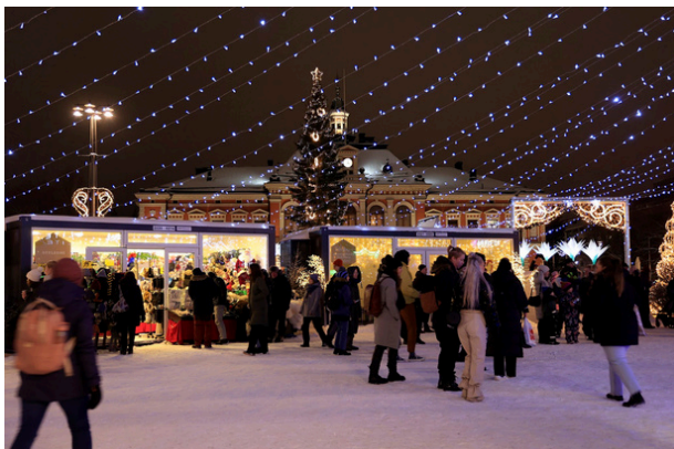
Joulutori