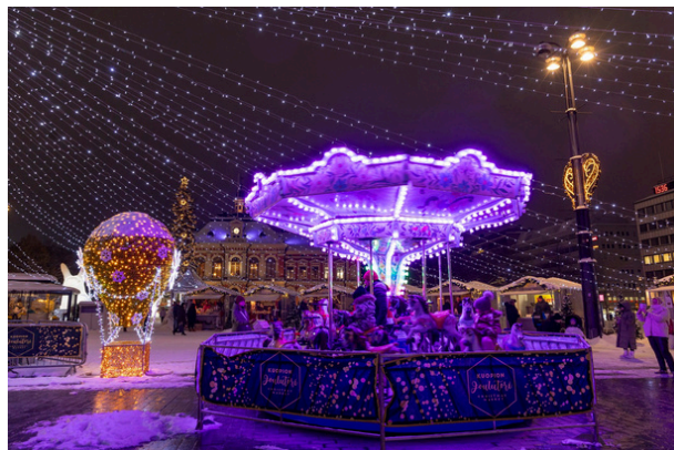
Joulutori