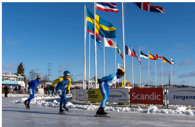
Ice Marathon