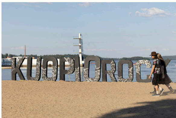
Kuopiorock © Vicente Serra