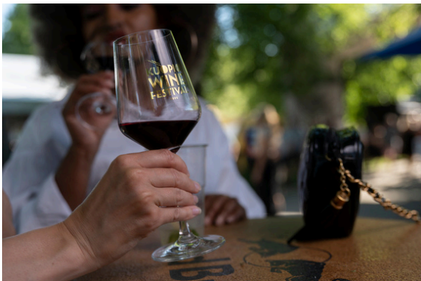
Kuopio Wine Festival