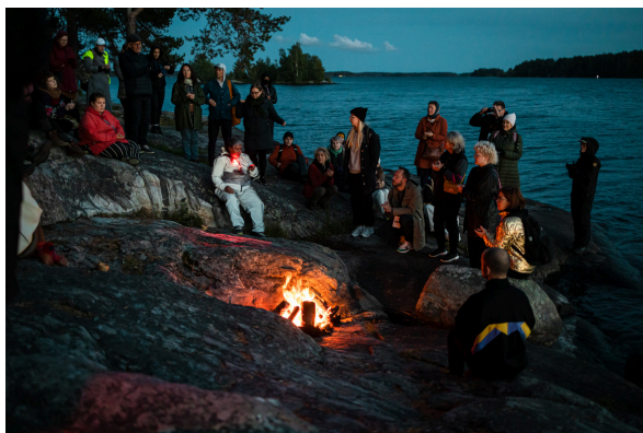
Ocean Island Mine ANTI Festival